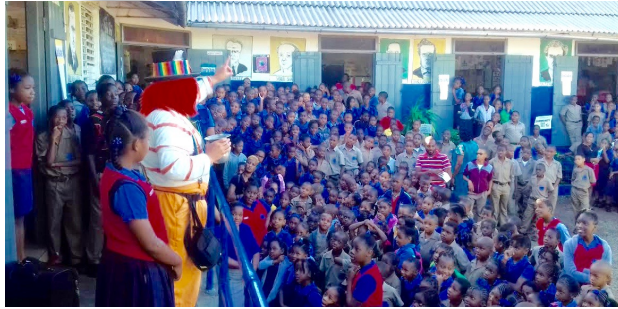
Third world Missions