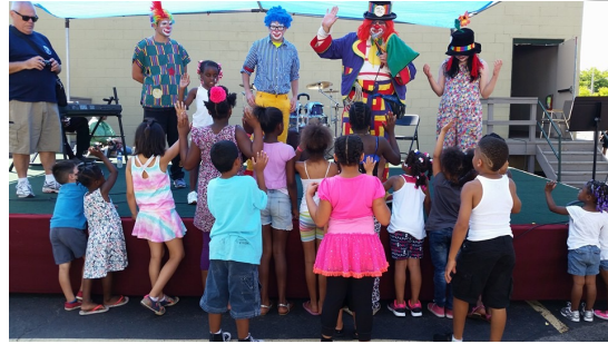
Inner - City Missions